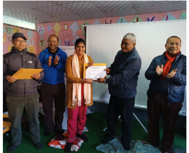
Certification for Teachers

So, Bungamati Foundation Nepal (BFN) distributed sponsorship packages for 2024 to children in remote areas of Lalitpur, Nepal. A total of 25 children received essential educational materials, including books, uniforms, shoes, and school bags. Children from six community schools, along with their teachers, participated in the distribution program. This initiative underscores BFN's commitment to supporting education in remote communities and ensuring that every child has the resources they need to succeed academically.