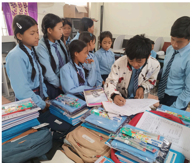
Children Receiving Sponsorship