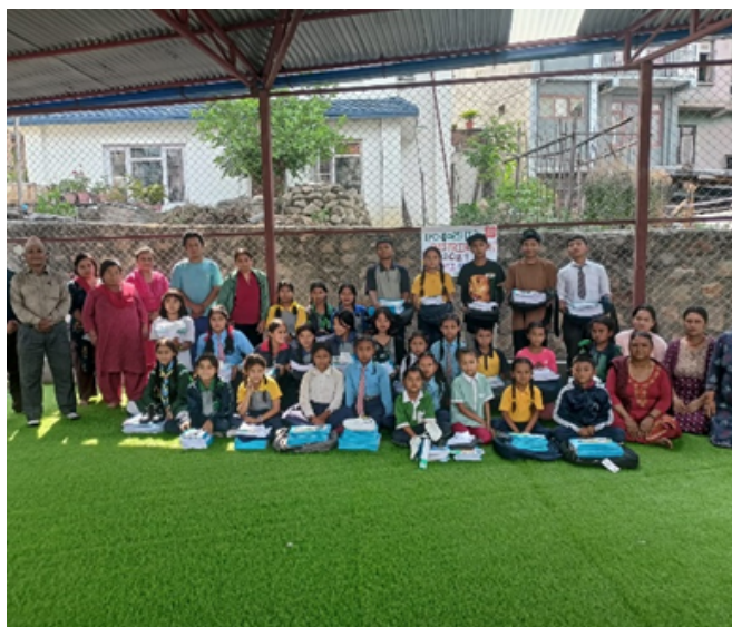
Sponsorship Distribution 2024