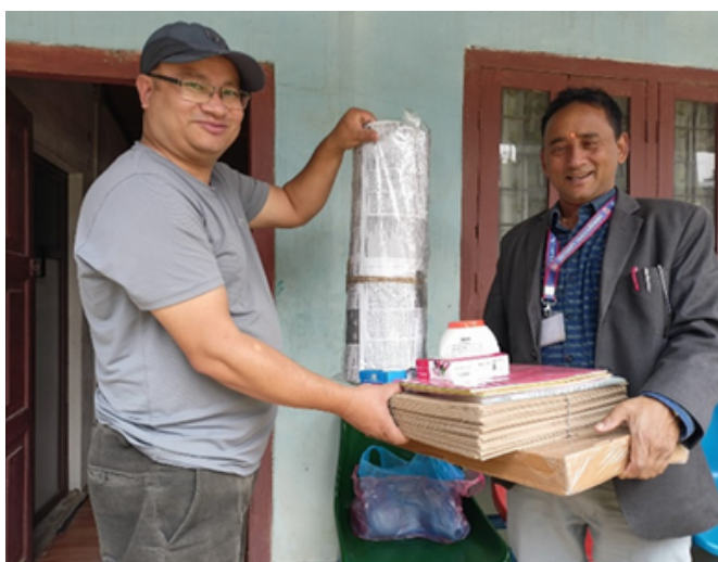
Educational Material Support