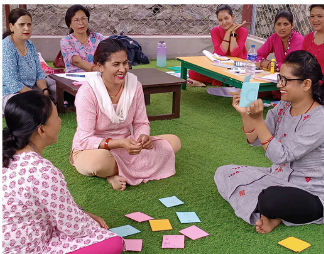
Flash Card Learning